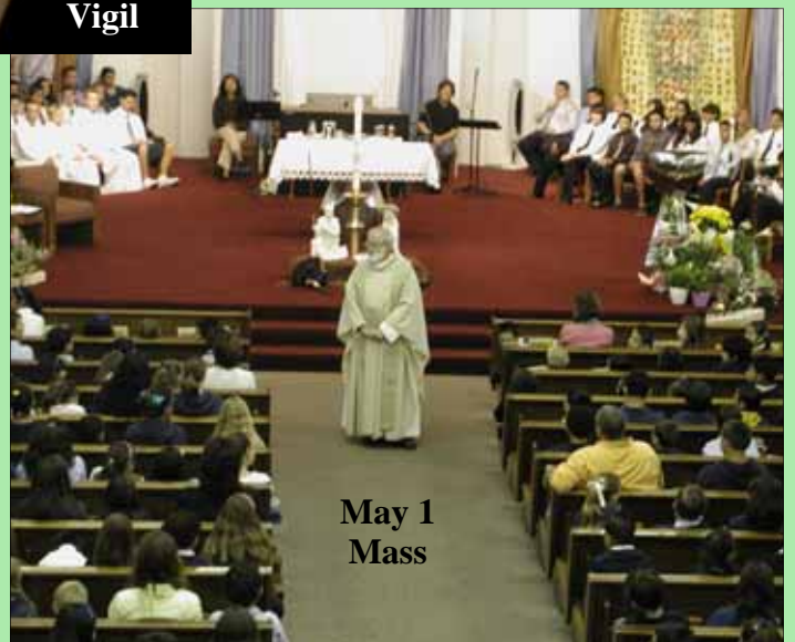
May 1 Mass