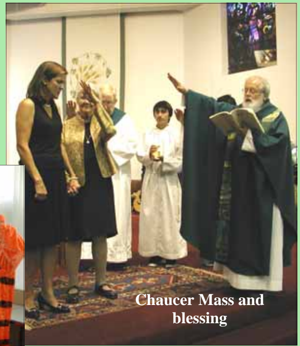
Chaucer Mass and blessing