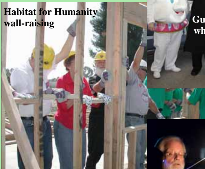
Habitat for Humanity wall-raising