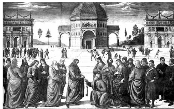
The Delivery of the Keys by Pietro Perugino

tell no one: Here, as in several other places in the gospels, Jesus attempts to keep his identity as the Messiah a secret.