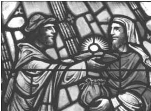
A stained-glass depiction of the Parable of the Pearl at the historic Cathedral Church of Saint Matthew in Dallas.

Scribe: This likely refers to the apostles and their later counterparts who are called upon to bring both the new teachings of Christ and the old teachings of the Hebrew scriptures to the people.